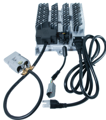
Above: IC650 "Comm" Charger with optional AC, DC and signal cables.